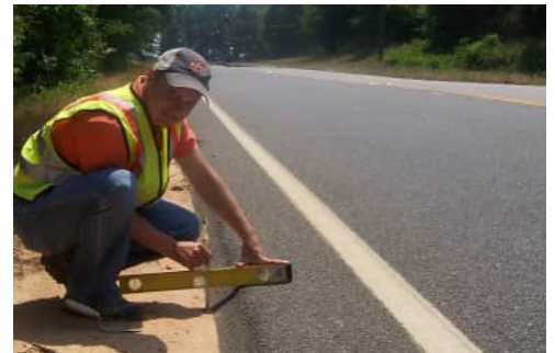
Example of the SafetyEdge SM after backfill material settles or erodes.

Transportation agencies should develop standards for implementing the SafetyEdge SM systemwide on all new asphalt paving and resurfacing projects where curbs and/or guardrail are not present, while also encouraging standard application for concrete pavements.