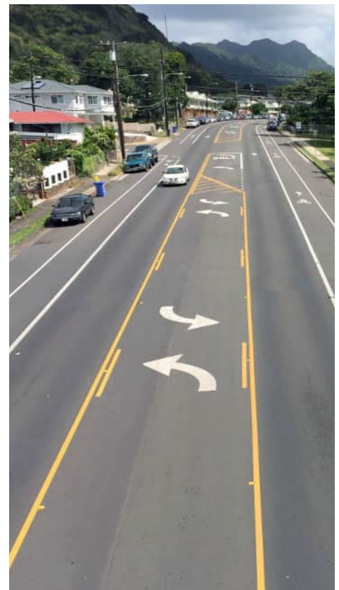
Road Diet project in Honolulu, Hawaii.

A Road Diet can be a low-cost safety solution when planned in conjunction with a simple pavement overlay, and the reconfiguration can be accomplished at no additional cost. Typically, a Road Diet is implemented on a roadway with a current and future average daily traffic of 25,000 or less.