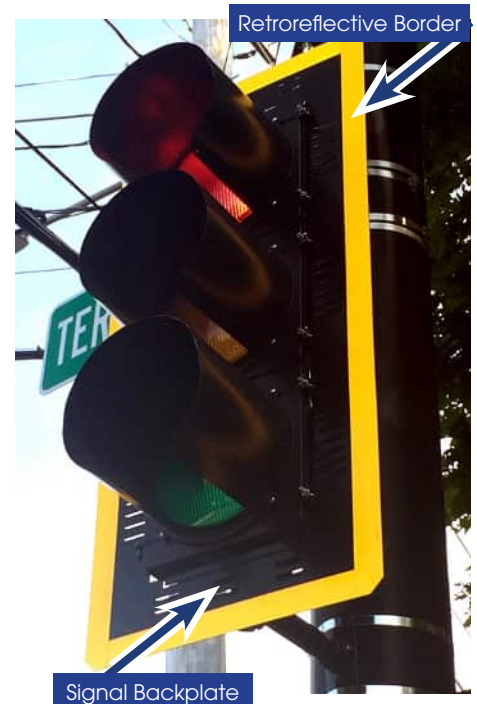
Signal backplate framed with a retroreflective border.

Implementation challenges include minimizing installation time, accessing existing signal heads, and structural limitations due to added wind load in instances where an entire backplate is added. Agencies should consider the design of the existing signal support structure to determine if the design is sufficient to support the added wind load.