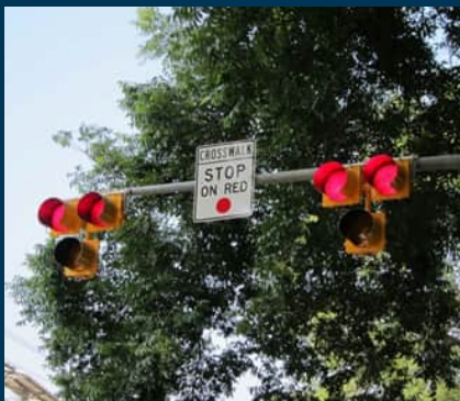
Example of PHBs mounted on a mast arm.

reduction in fatal and serious injury crashes. 3