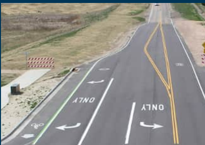
Left- and right-turn lanes on a two-lane road.

For more information on this and other FHWA Proven Safety Countermeasures, please visit https://safety.fhwa.dot.gov/provencountermeasures/ and https://www.fhwa.dot.gov/publications/research/safety/02103/02103techbrief.pdf .